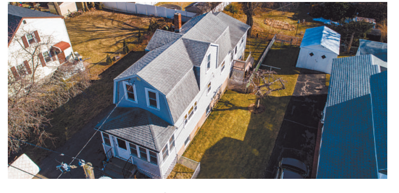
257 Winthrop Street, Quincy | Sold $385,000 | 3 BD | 2 BA | 1,400 SF