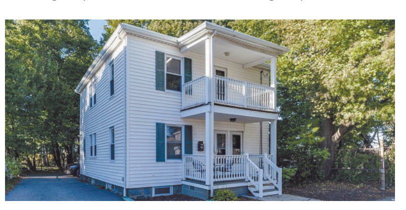
12-14 Mound Street, Quincy | Sold $525,000 | 4 BD | 2 BA | 1,500 SF