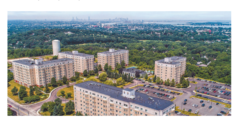
1 Cityview Lane, Unit 515, Quincy | Sold $363,750 | 1 BD | 1 BA | 902 SF