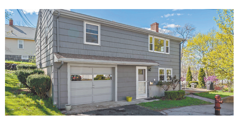
26 Richard Street, Quincy | Under Agreement $449,900 | 2 BD | 2 BA | 1,195 SF